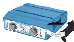
Wedge og Wedgekit